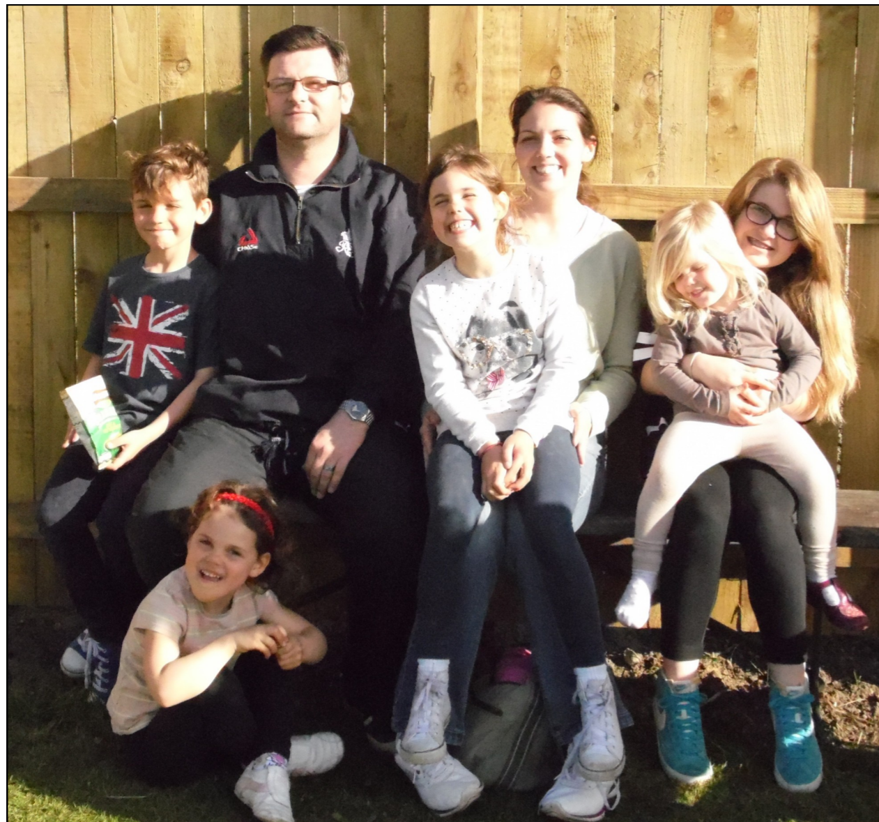
The Shaw Clan arrive at Feethams.